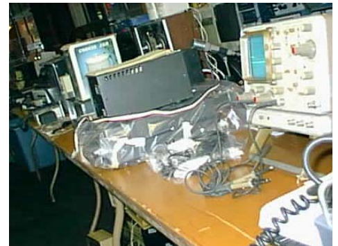
Some of the equipment waiting to be auctioned at last month's RVWARS Auction