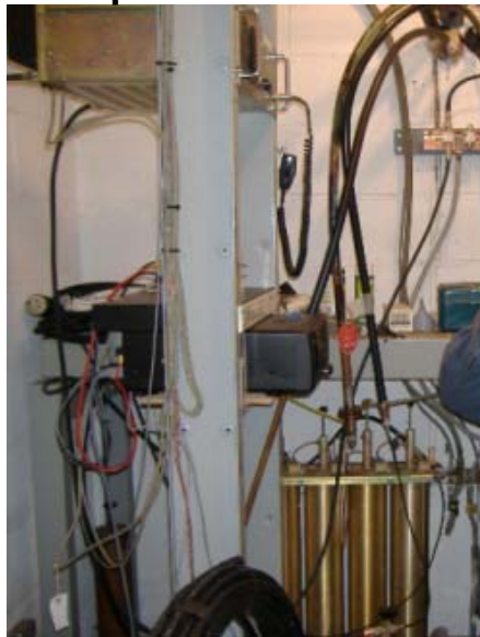
This picture shows the canisters (the 3 brass tubes at the bottom) that required tuning.