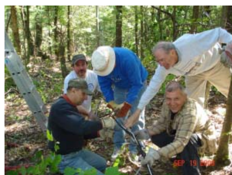
Wire Splicing 101