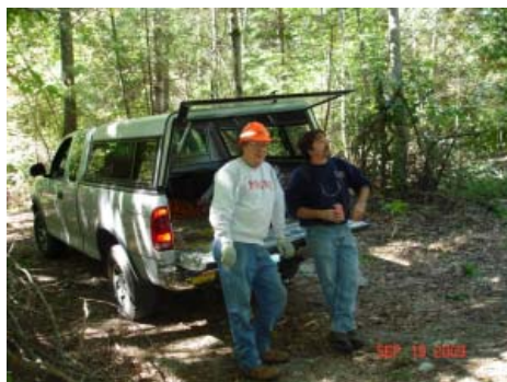
You'd think it was a Railroad Job!