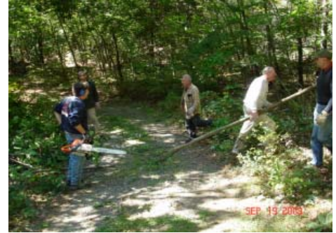
Clearing the Access Road