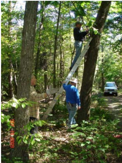
Getting the wires back up