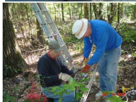
Getting the wires ready to go up