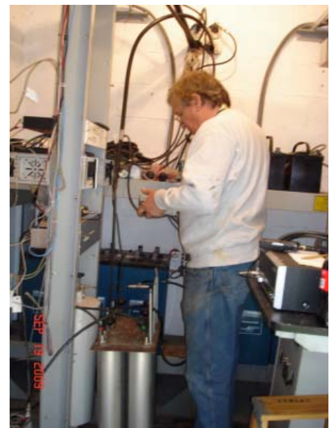
Hmmm! Seems to be a cable left over!