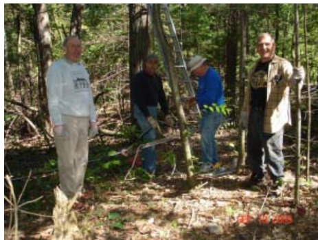
The ladder's up! Now what?