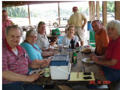
"Picnickers" at the August 30th Annual Picnic