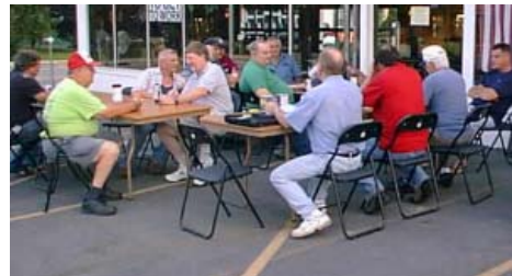
"Rippers" enjoying a summer Dinner Meeting