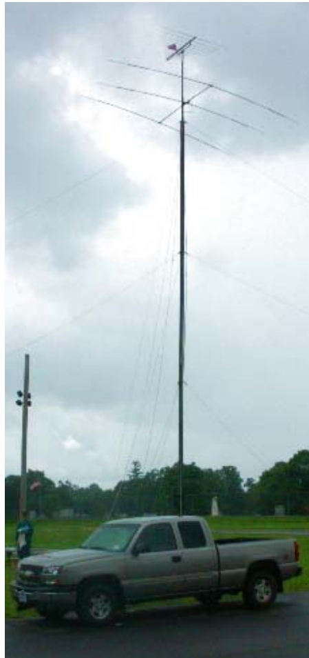
Neat mobile antenna! Must be hard driving under trees and bridges! Barry, WA2KLP, snapped this shot of the Ripper's beam and tower (on the far side of the truck!) at this year's Field Day.