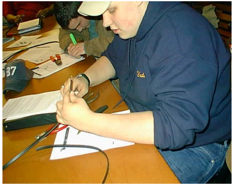
Measuring, cutting, and assembling Antennas, Radios, and Celebrating QSOs!